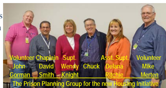
The Prison Planning Group for the new Housing Initiative